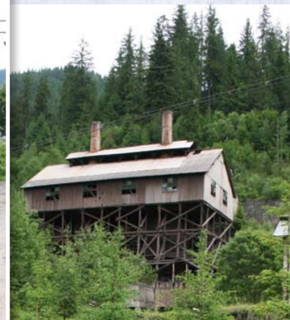
I've absolutely no idea what this was, apart from derelict, but I want to live there!