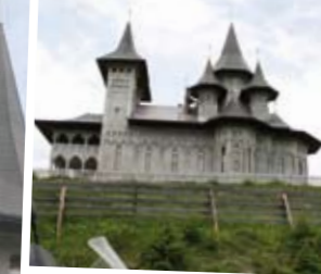
Turns out to be an Orthodox church under construction - right on top of a remote mountain top!