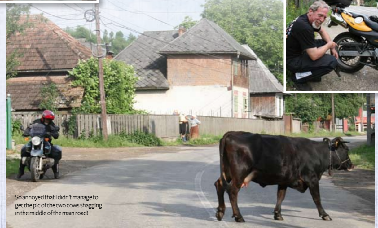
So annoyed that I didn't manage to get the pic of the two cows shagging in the middle of the main road!

Book your Transylvanian tour of a life time on this free 'phone number - 0808 101 6781 - or check out the website at www.motorcycle-tours.travel