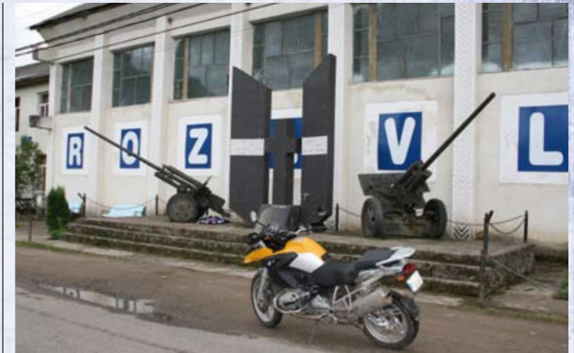
Just so you don't forget that this was once a Warsaw Pact country ...

place for the night. Okay, so I haven't actually seen that many chainsaw-carved spiral staircases, I have to admit, but this was just a work of art - beautifully done, but not prissily so, y'know? Big logs - fitted together very cleverly. Well, it impressed me anyway.