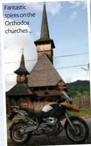
Fantastic spires on the Orthodox churches...

In fact it was over all too soon when after twenty or thirty miles, it felt like, of heavenly riding the lead bike pulled into a petrol station. We all needed fuel, I know, but it was such a shame to have to stop. After re-filling, we set off again and not long after turned off down a more 'normal' Romania road and were