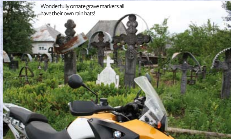
Wonderfully ornate grave markers all have their own rain hats!