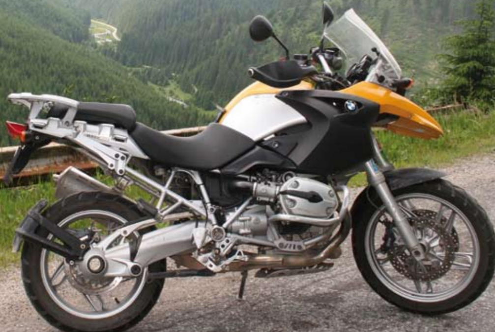
Climbing into the mountains again, the scenery was just lovely. The Armco has, worryingly, seen a bit of use though ...