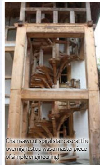
Chainsaw cut spiral staircase at the overnight stop was a masterpiece of simple engineering!

overnight stop at Barsana and so, while there were lots and lots of photo opportunities, I didn't really get much chance to stop to take them. We wound our way through stunning countryside - it's that time-travel thing again - and eventually arrived at our destination to be greeted by the most amazing monastery with spires like hypodermic needles, and the coolest chainsaw-carved spiral staircase at our resting