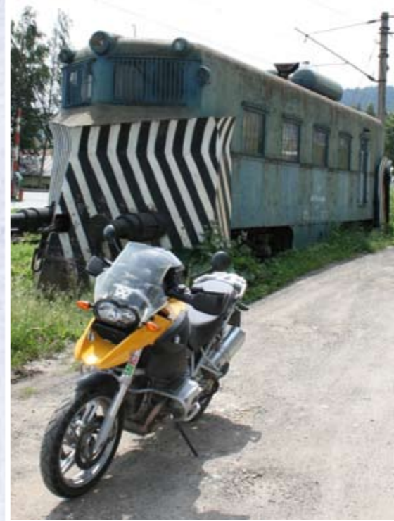
Fantastic old Soviet era train abandoned by the side of the tracks ...